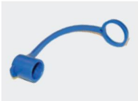
Blue Plastic Cap - Nipple.