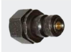
Self-sealing quick-connect nipple.