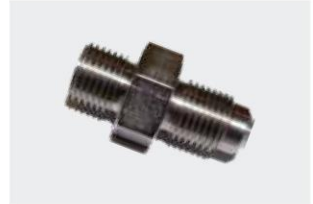
1/4" BSP 60° cone male/male adapter.