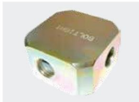
1/4" BSP Elbow Block (Two-Way).