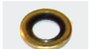
Bonded Washer Seal for 1/8" BSP.

HYTORC owns all content, copyrights, trademarks and patents in this document. © 2021 HYTORC. Any unauthorized use or distribution of any material from this document is strictly prohibited.