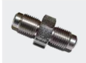
1/4" BSP male/male adapter.