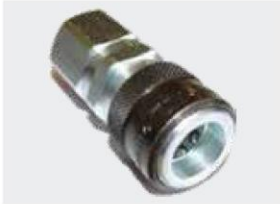
Self-sealing quick-connect coupling.