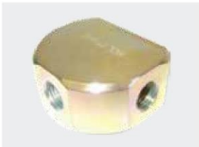
1/4" BSP Tee Block (Three-Way).