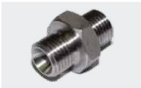
1/4" BSP / 1/4" BSP male/male adapter with 60° female cone on each end.