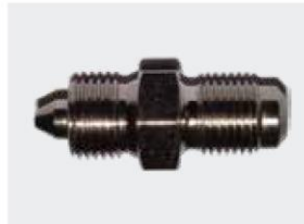
1/8" BSP Plug.