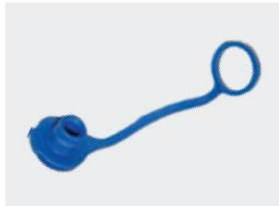
Blue Plastic Cap - Coupling.