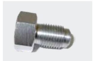
1/4" BSP Plug.