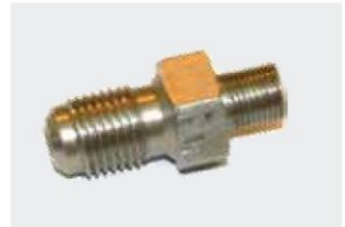
1/8" BSP / 1/4" BSP male/male adapter.