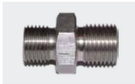
1/4" / 1/4" BSP male/male adapter with 60° female cone TO 9/16" male adapter.